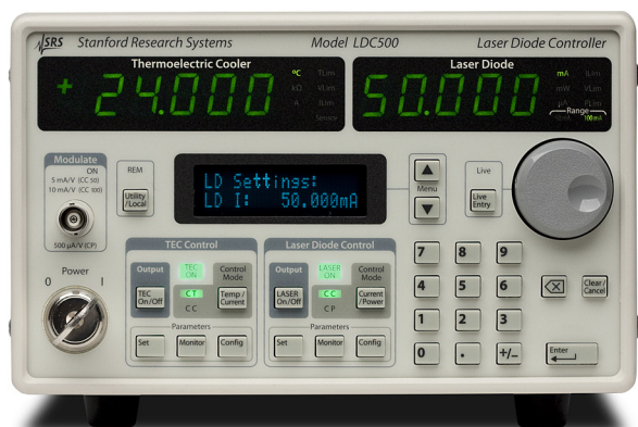
LDC500 front panel

The LDC500 series offers an auto-tuning feature which automatically optimizes the PID loop parameters of the controller. Of course, full manual control is provided too. Dynamic transfer between CT and CC modes for the TEC is also easy — just press the Temp/Current button.